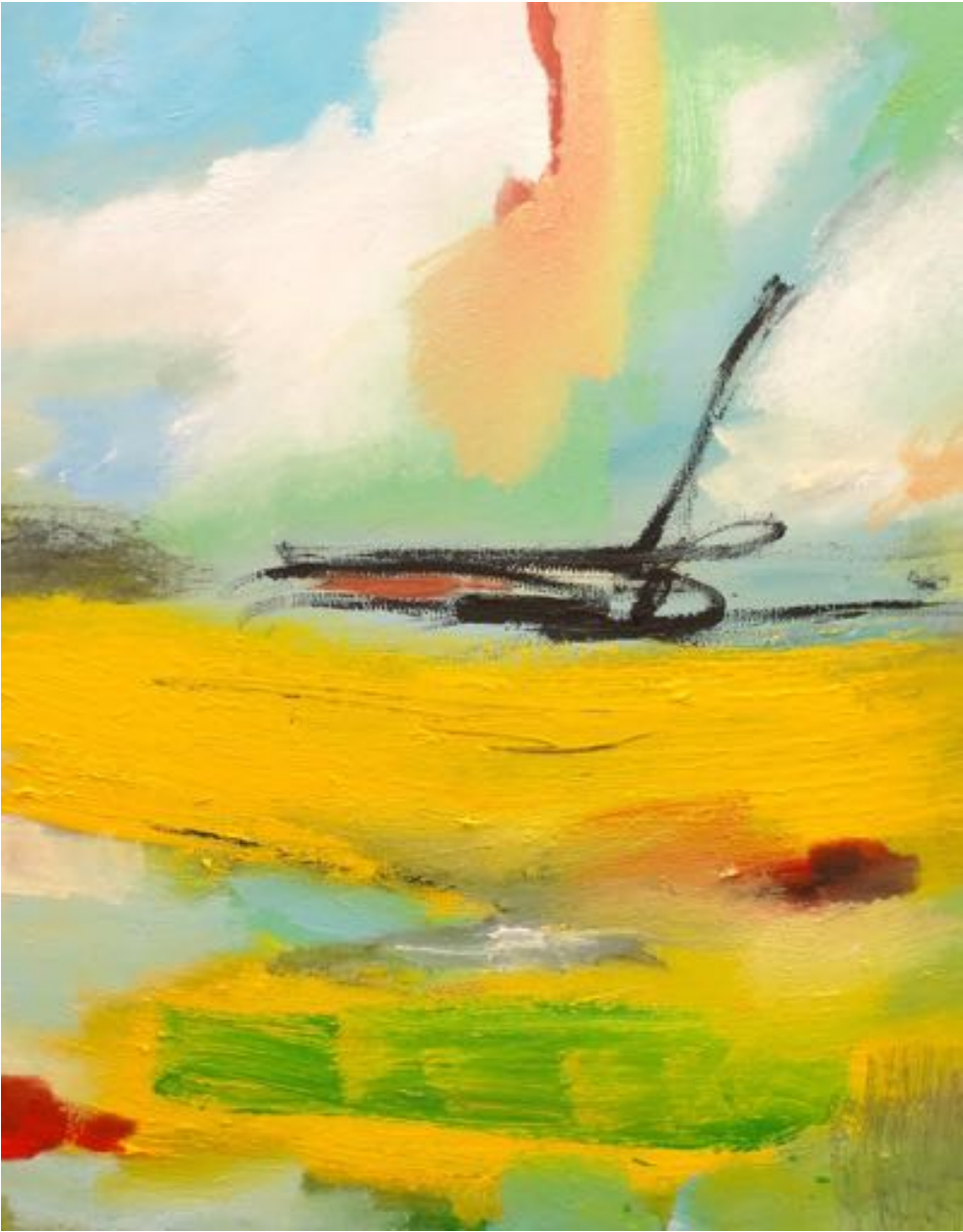
Canyon 16 - 20x16.8in. - oil on canvas