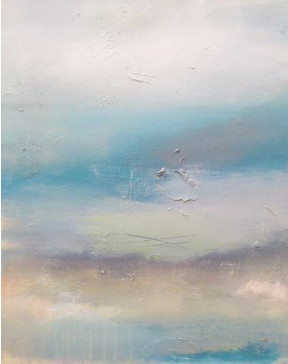
Horizon 21 - 20x16x.8in. - oil on canvas