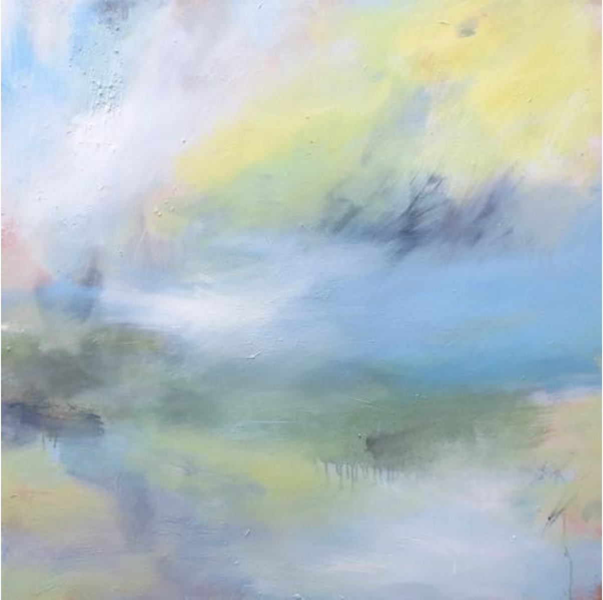
Enchantment 8 - 30x30x.8in. - oil on canvas