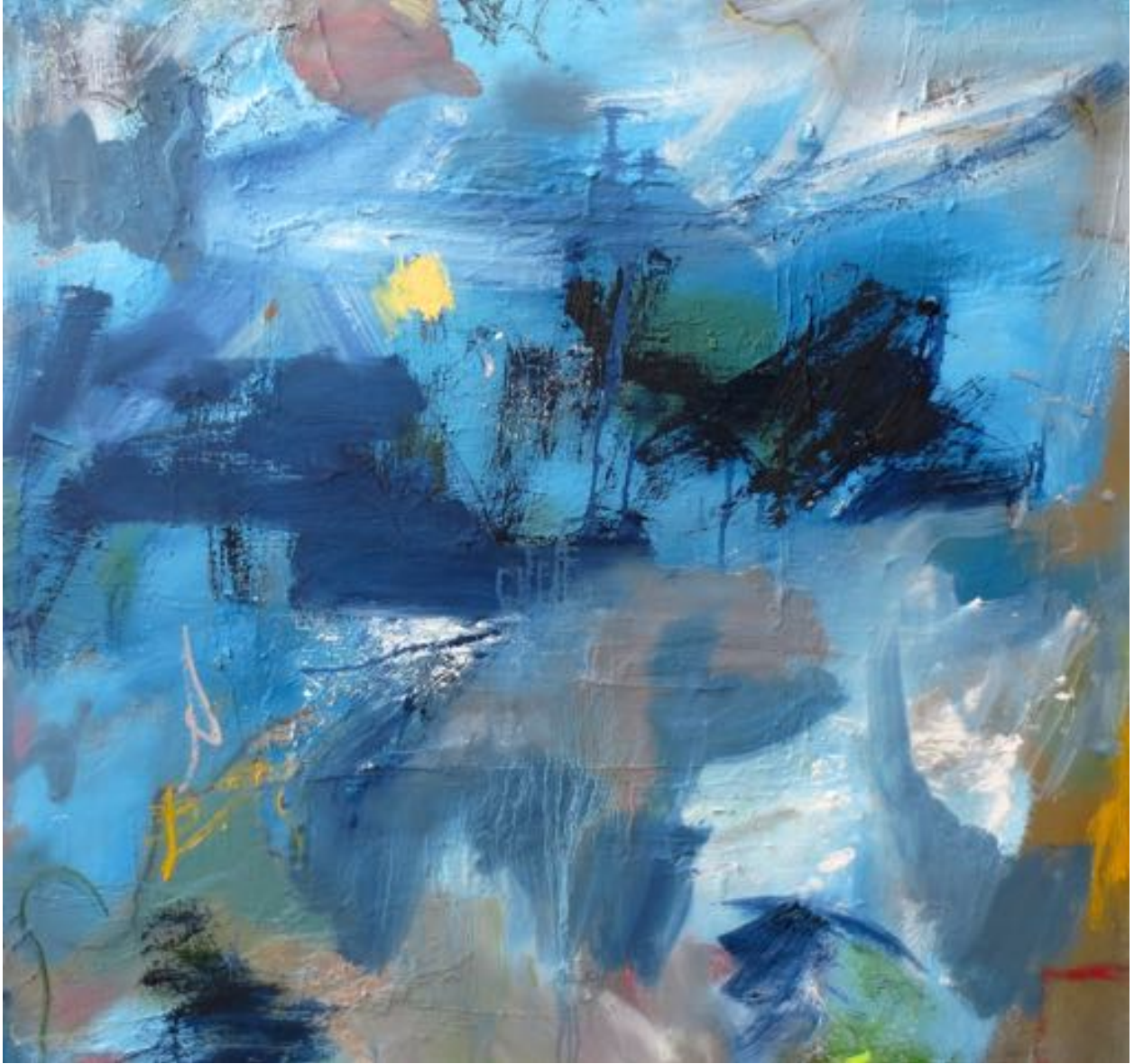
Aspen - 39x39x2in. - oil on canvas