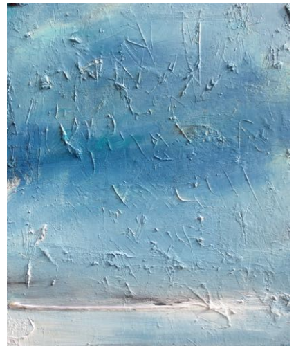
Blue Jeans Series (6) - 22x18x1in. - oil on canvas