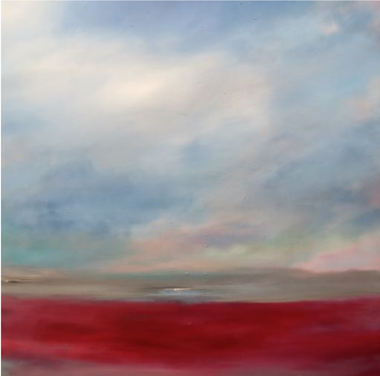
Horizon 7 - 48x48x1.5in. - oil on canvas