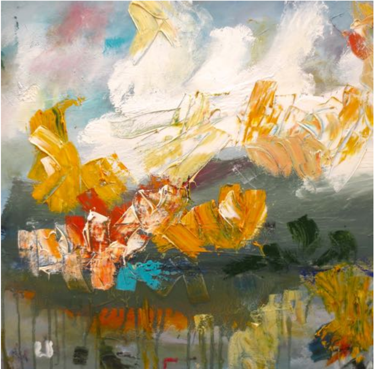
Giverny - 24x24x2in. - oil on canvas