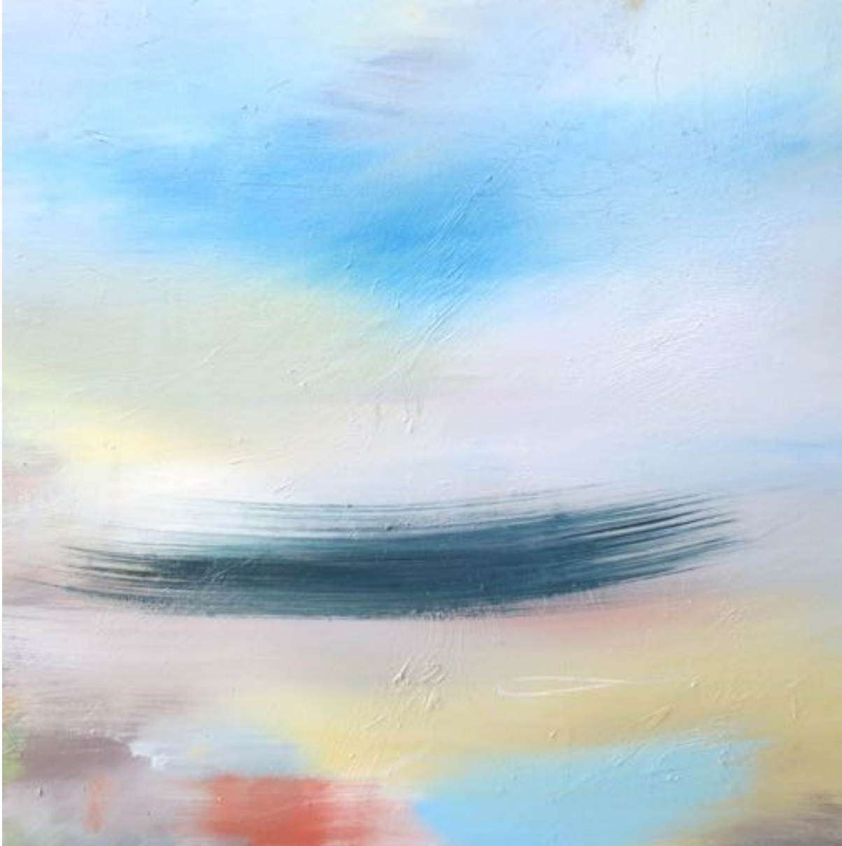
Enchantment 6 - 24x24.8in. - oil on canvas