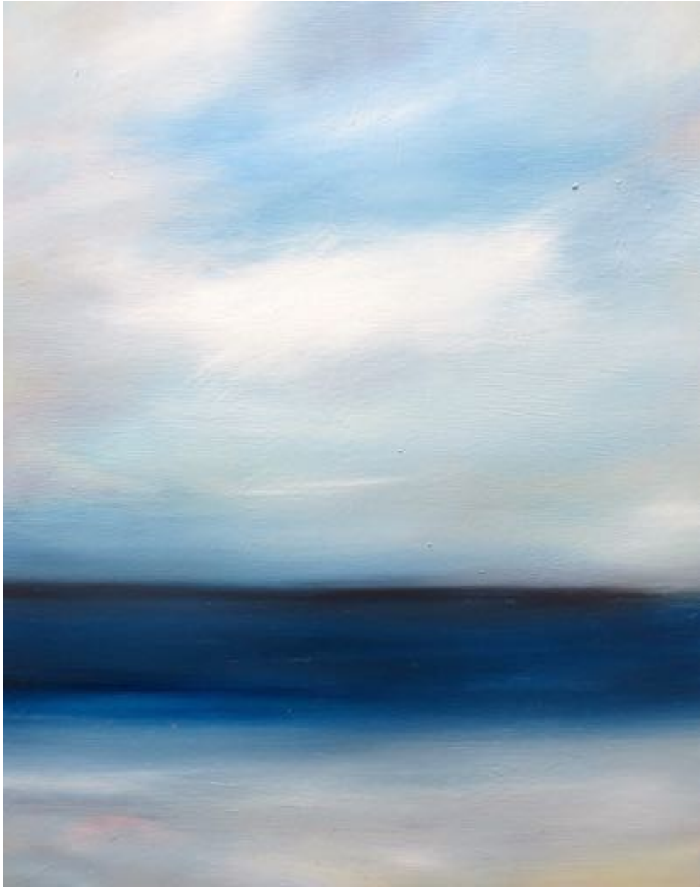
Horizon 22 - 28x22x1.5in. - oil on wood panel