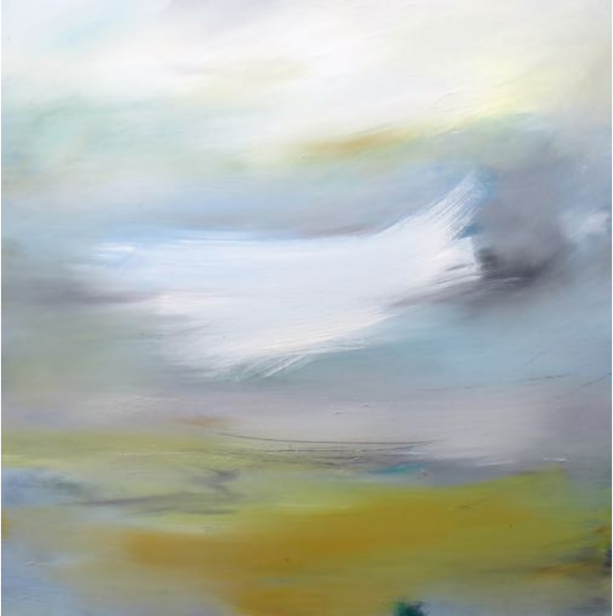
Enchantment 7 - 36x36x2.5in. - oil on canvas