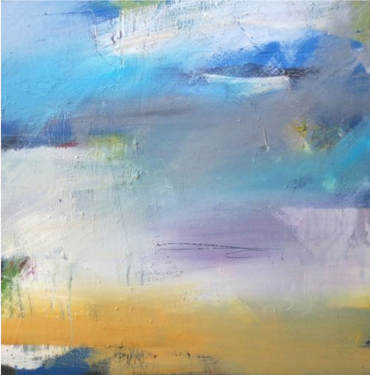
Enchantment 11 - 30x30.8in. - oil on canvas