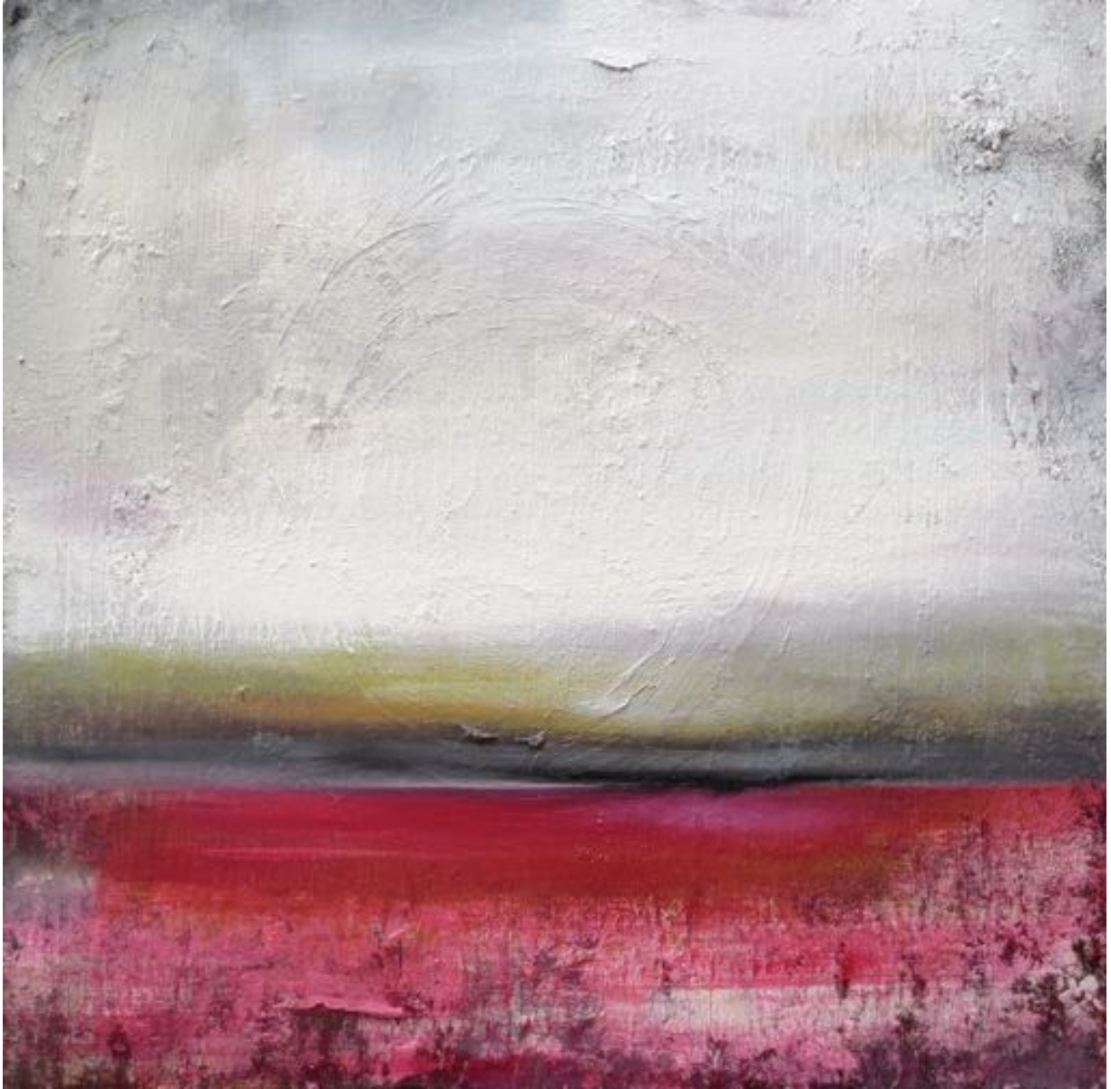
Horizon 5 - 36x36x2.5in. - oil on canvas