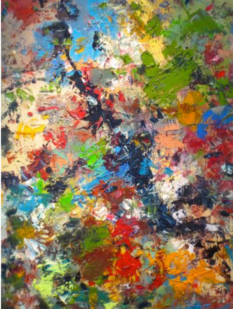
Urban 2 - 46x35x1in. - oil on canvas