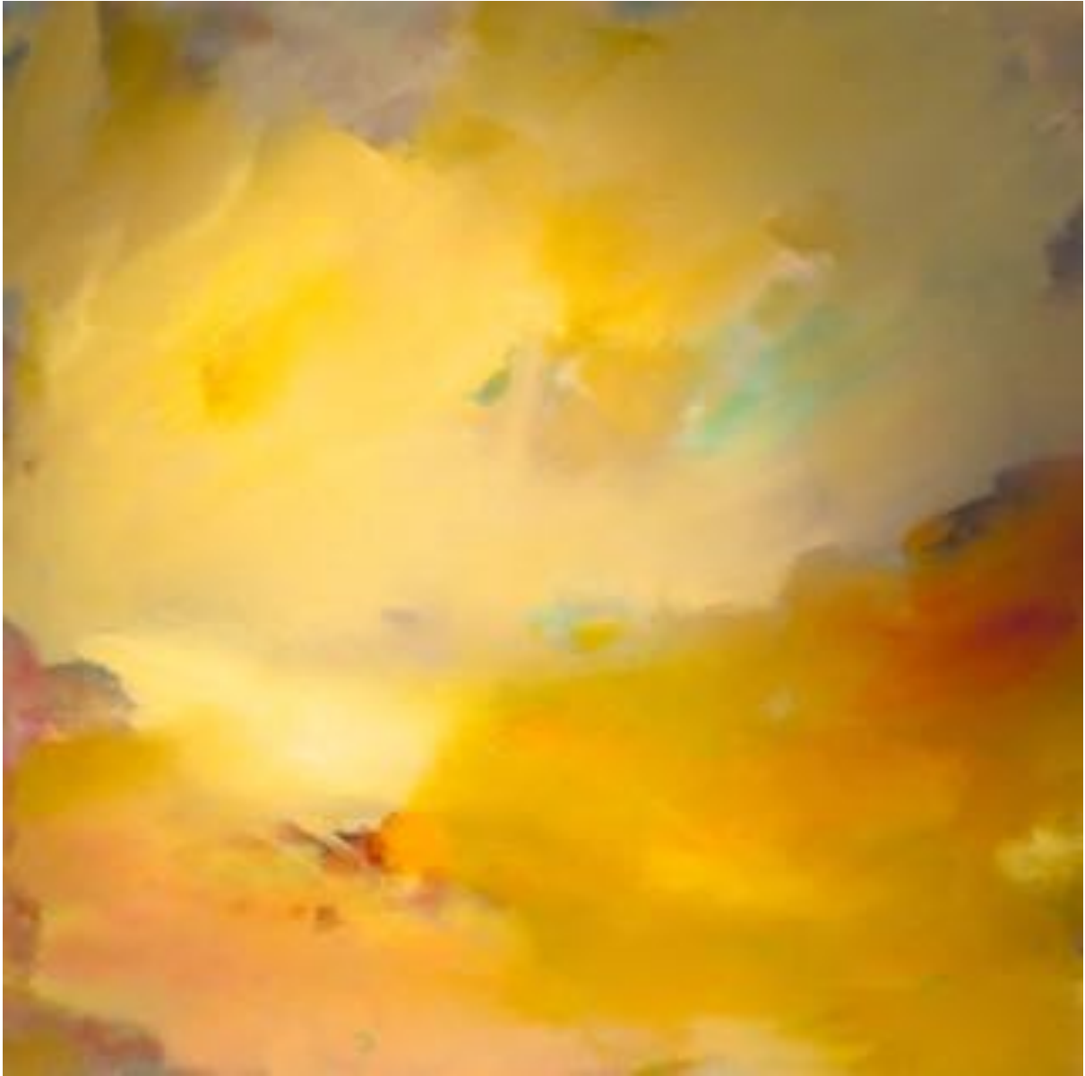
Pineapple - 31x31x1.5in. - oil on canvas