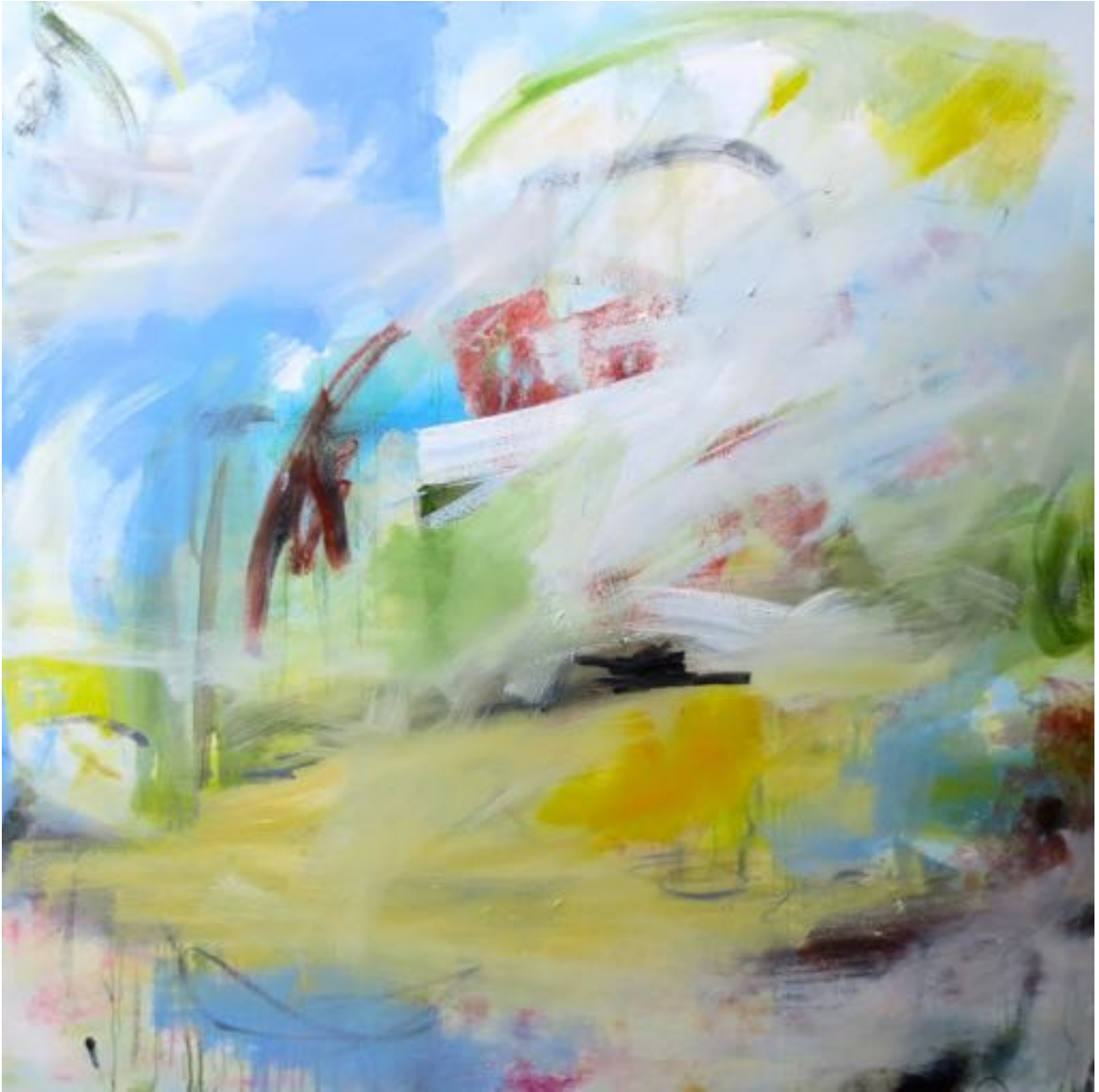
Enchantment 1 - 48x48x1.5in. - oil on canvas