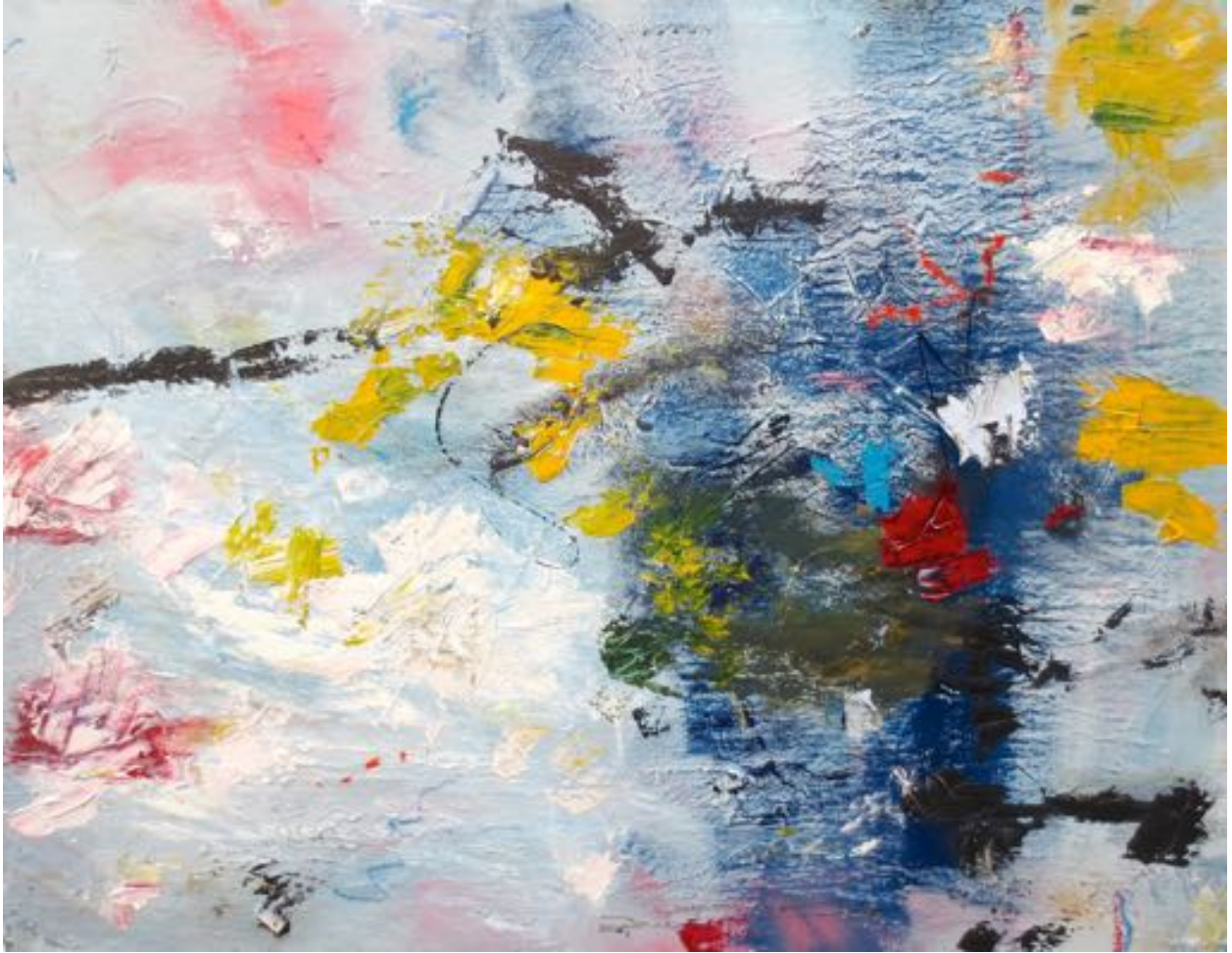
Summertime - 35x46x1 in. - oil on canvas