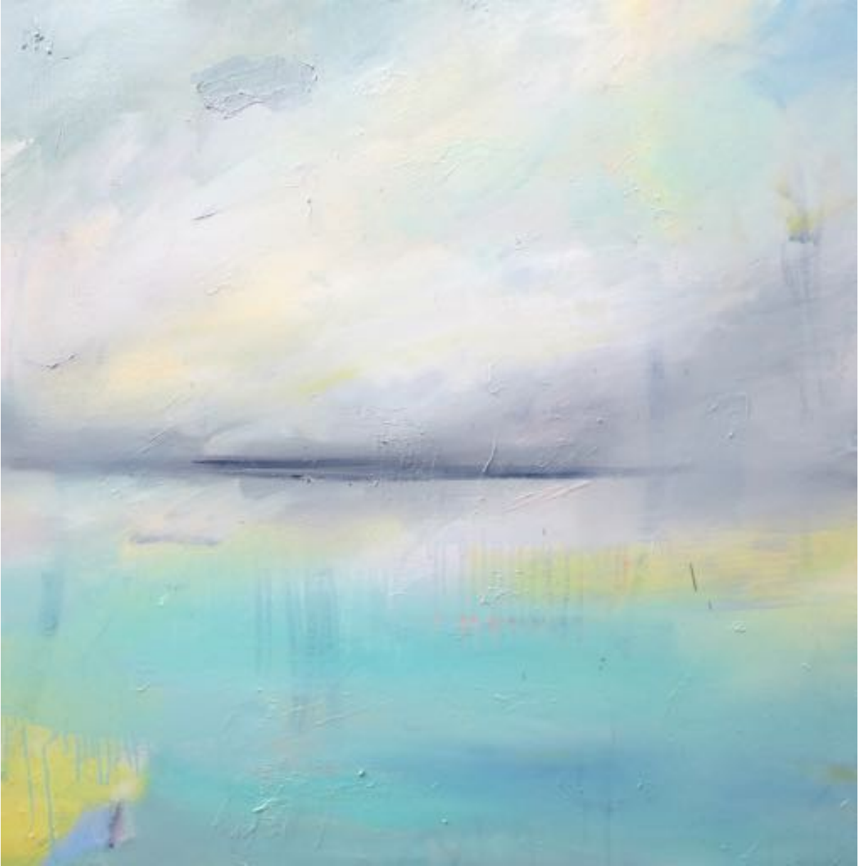
Horizon 4 - 36x36x.8in. - oil on canvas