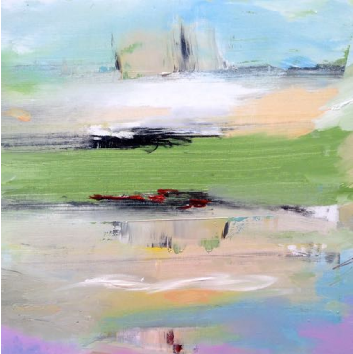
Horizon 17 - 24x24x.8in. - oil on canvas